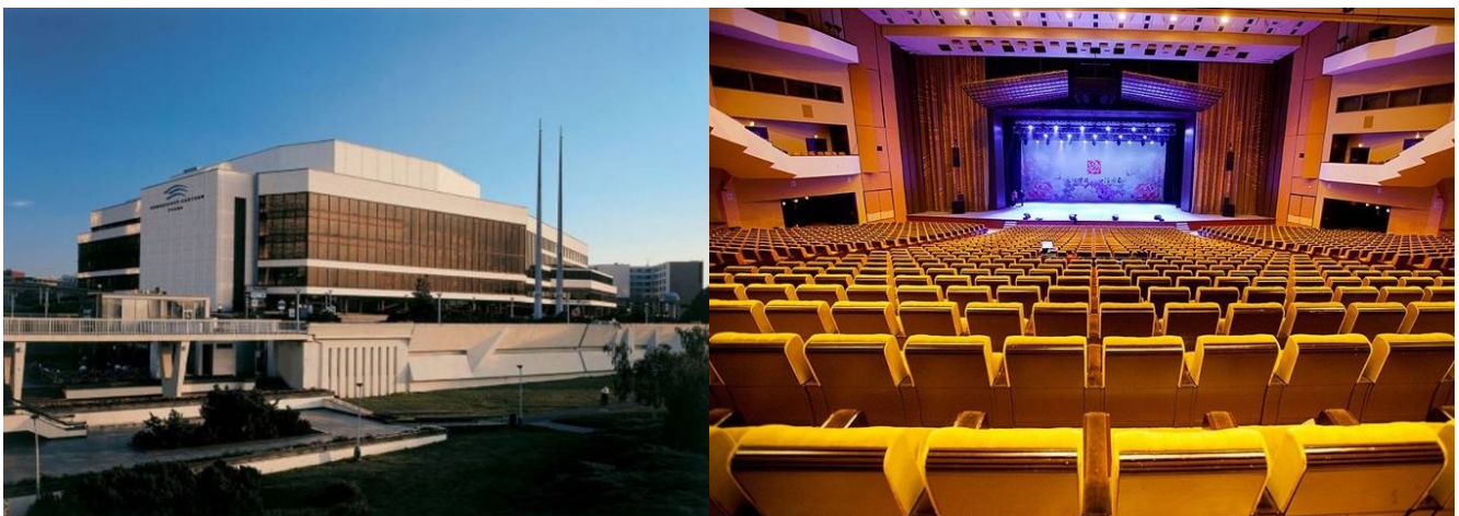
Prague Congress Centre