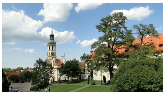
Strahov Monastery gate, Loreta