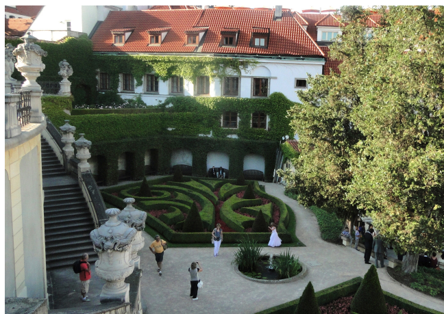
Loretánská Street with a view of Prague Castle, Vrtbovská Garden in Malá Strana