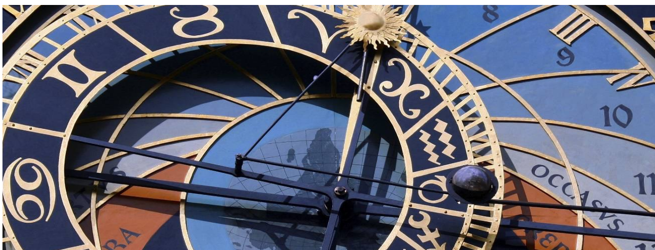
Astronomical Clock, Prague Old Town Square

The Congress Organizing team will be at your full disposal to consult various marketing opportunities and help you choose the right option or design the right solution for your business throughout the XXIII ISPRS Congress.