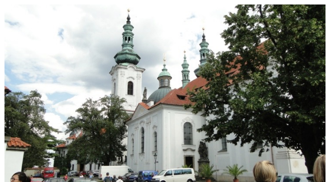
Strahov Monastery, Church of St. Roch